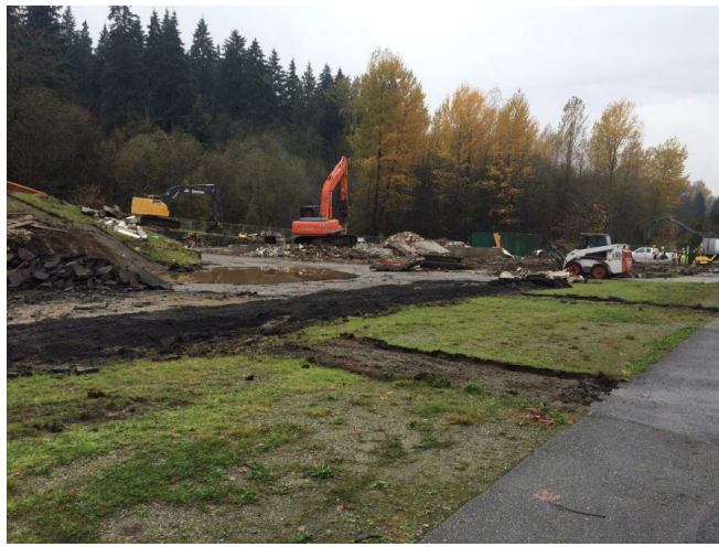
Construction zone—D building is gone!