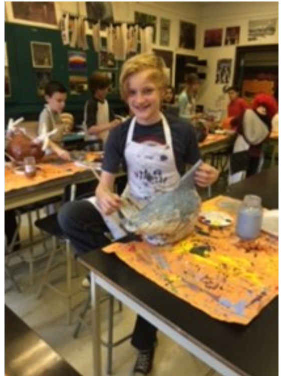
Shark Attack with paper maché

After School Art Programs - our Art programs are well under way, in fact we have only one week left to finish up this session. Stay tuned for the Spring Session information.