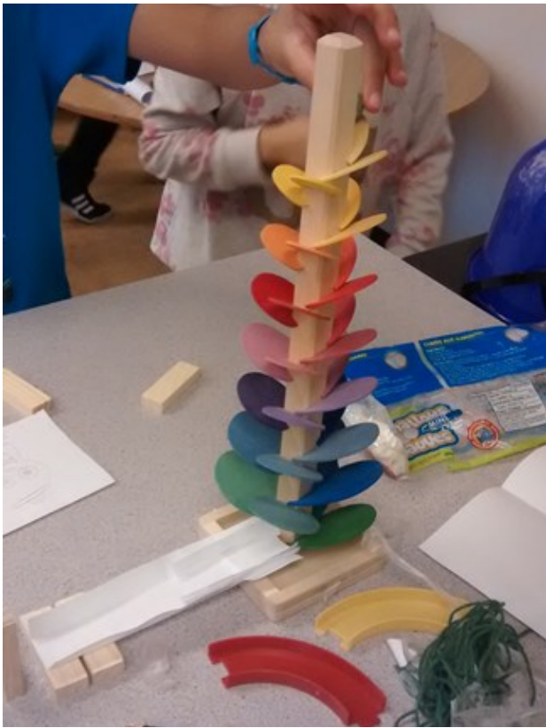
Earth Pod—Rube Goldberg machine